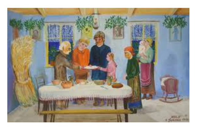
Illustration showing family sharing the Christmas wafer called Oplatek, in a traditional cottage setting with a sheaf of straw in the corner, one of the old Polish Christmas traditions.

This year has certainly flown by and did you get to see any of the Sunday Winter Films? There was a great line up. Next newsletter will be Jan/Feb 2013 so we wish Christmas Blessings to you, your family and friends